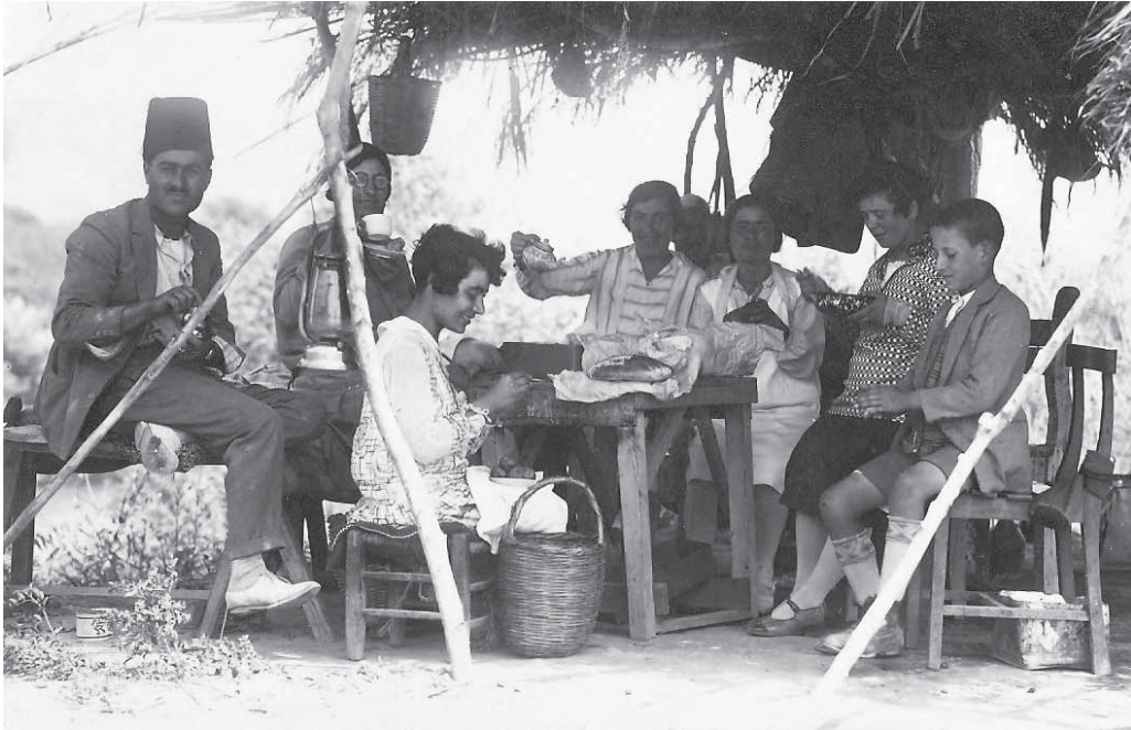
Picnic, undated.