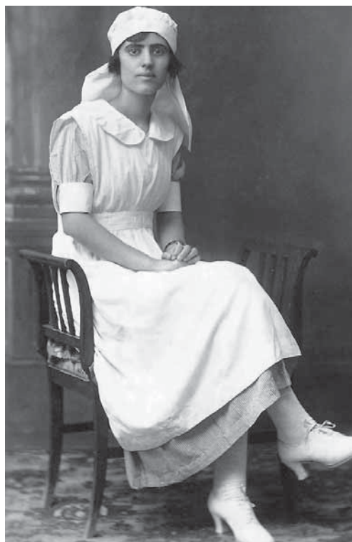
Nurse in Acre Government Hospital, undated.