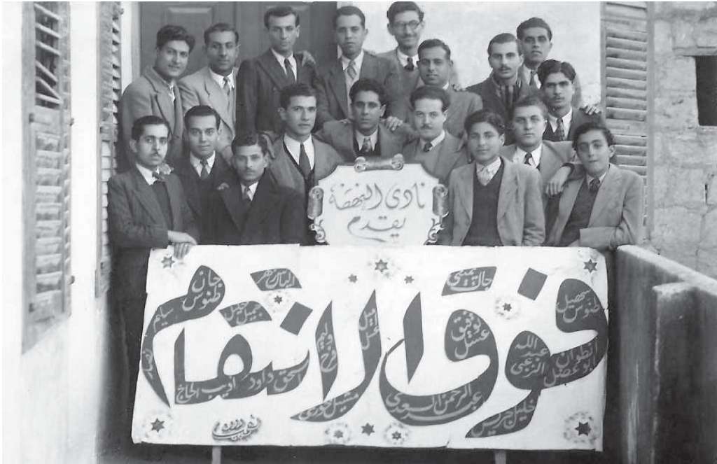
Nahda Theatrical Group and Literary Club, Nazareth, 1946.