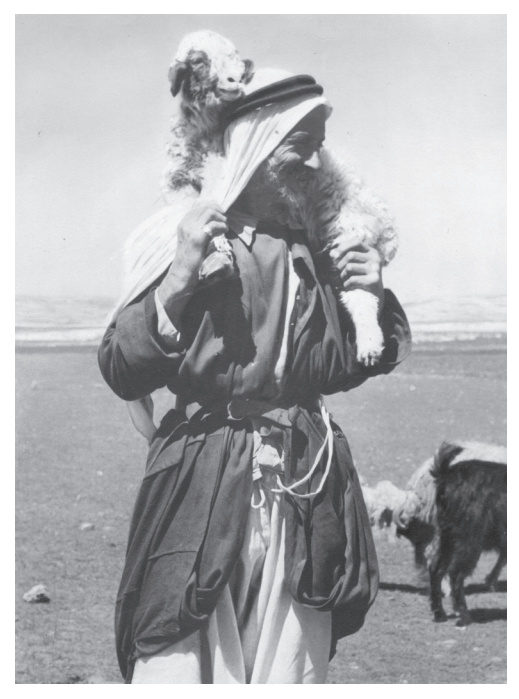
Shepherd carrying sheep, hand tinted, mid- to late 1950s.

The documented contribution of the Albina brothers took place in the photo lab, where the two brothers developed glass negatives for such formats as lantern slides and paper prints – both plain and hand tinted – stereographs, panoramic views, postcards, and same-size contact prints, <sup>24</sup> formats they would later market in their own studio as indicated in a recently acquired ad for their business.