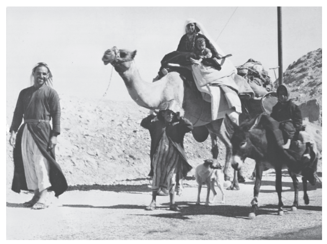
[Figure 13:] Bedouin family, mid- to late 1950s, 25.5 cm x 20 cm.

the family to safety, to Amman, hoping to make a living until the Palestinian issue was resolved. He worked sporadically for two years until in 1954 he found a position with the Point Four program – a USAID program to Jordan, run by the American embassy in Amman. There, he could once again do what he loved best. In addition to developing photos, he traveled with the American embassy staff to places such as Qumran and the East Ghor Canal. The week after his return from one such travel, he developed a set of photos of Bedouins and shepherds. Our family and the embassy staff suddenly became aware of Father's artistic eye in capturing a scene on negative or hand tinting a print. All requested a copy. Looking back, I wonder if the admiration of his work then was not more painful than pleasurable for Father, reminding him of what he had achieved in his other life – and lost. Indeed, as I recall, he seemed to shrug off any compliments received. For the next ten years, Father remained at the embassy, mentoring up-and-coming young photographers in the art of developing negatives. During those years, the only comment my siblings or I ever heard him make about the past – one that would stay with me – was, "We always lived together well, why this now?" In retrospect, these few words and his tears that September day in Jerusalem expressed as best he could his understanding of what had happened.