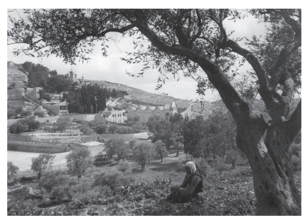
View of the Garden of Gethsemane, 1930s–1940s.