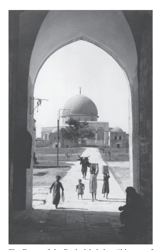
The Dome of the Rock, labeled as "Mosque of Omar," Jerusalem. Undated postcard, 13.5 cm x 8.5 cm.