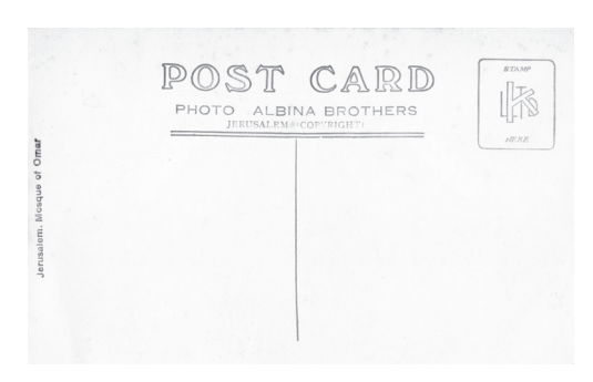
Reverse of Mosque of Omar postcard.