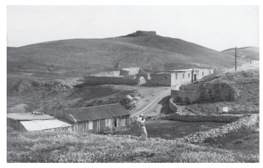
Good Samaritan Inn, Jericho. Postcard, circa 1940s, 13.5 cm x 8.5 cm.