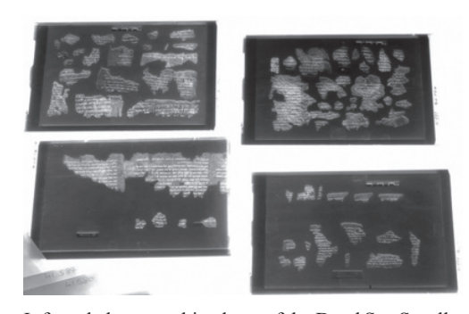
Infrared photographic plates of the Dead Sea Scrolls, circa 1950s.

The year 1948 brought to an end the 47-year old partnership of the two brothers – a partnership that had seen them through disease, natural disasters, famine, orphanhood, two World Wars, conflict and rebellion, an education side by side, and successful careers. At some point, they had even purchased a piece of land, again in joint partnership. Henceforth, they would lead separate lives, seeing little of each other.